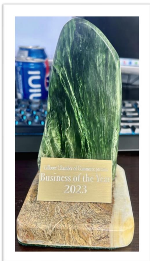
Sekw’el’was LP. Congratulations team!

The Lillooet Chamber of Commerce awarded the 2023 Business of the Year (Environmental Category) to Splitrock Environmental